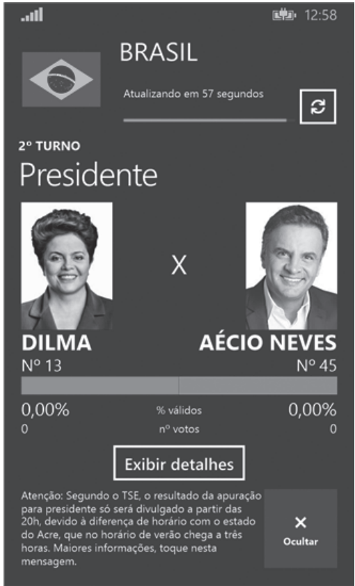
FIGURE 4 TSE's vote counting app in the Brazilian 2014 elections

Publisher's note: image whose layout and texts could not be formatted and proofread due to the technical characteristics of the original files provided by the authors for publication.