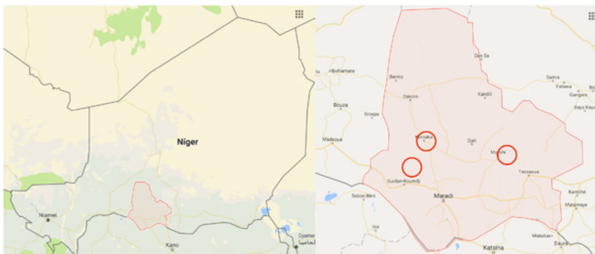
FIGURE 3 Intervention area of the pilot project