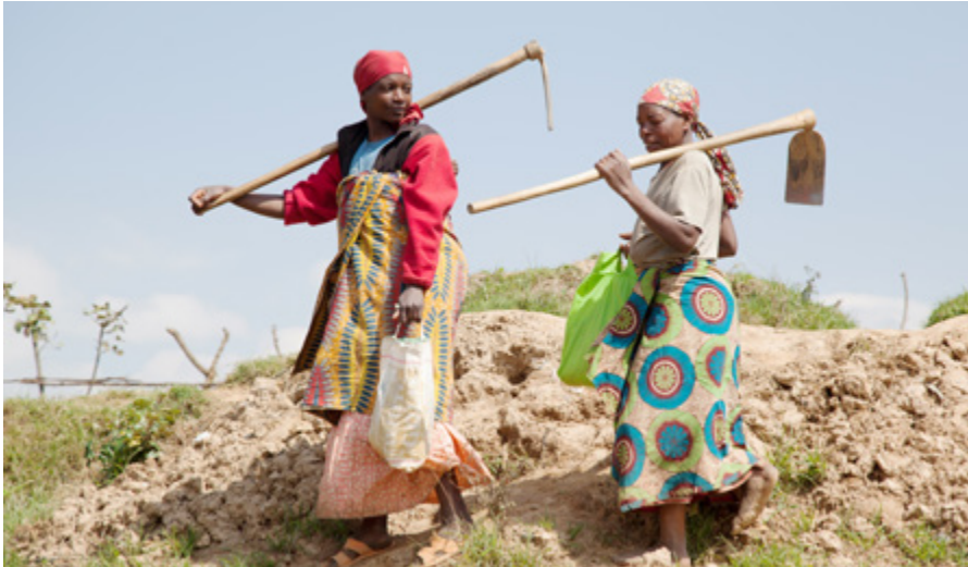
Photo: A'Melody Lee/World Bank. Women work to pay their expenses and to improve their quality of life, Rwanda, 2013 < https://goo.gl/6j85e1 >.

“ Addressing gender inequality and promoting women’s empowerment through the provision of social protection is a basic human rights issue.