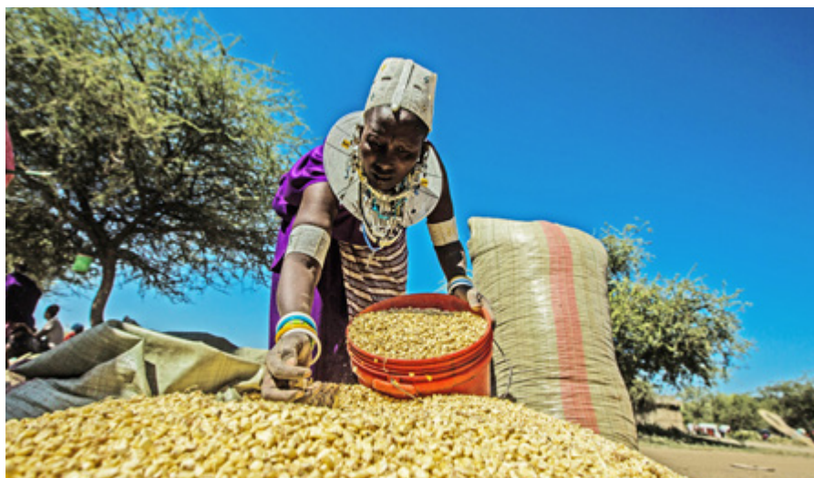
Woman sells corn at the Maasai market in Mto Wa Mbu, Tanzania, 2015 < https://goo.gl/eaUrHp >.

“ For a long time, women in Tanzania have been left out of socio-economic development cycles.