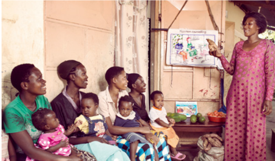
Woman teaches mothers with small children about nutrition, Uganda, 2015 < https://goo.gl/paEiTr >.

“ To ensure effective action and results, governance mechanisms and processes of non-state actors in social protection should be gender-sensitive through explicit attention to both women’s and men’s articulation of their interests.