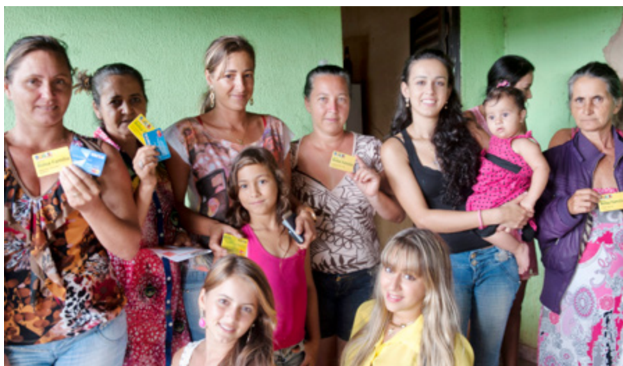
Women of the Calon Roma community who are beneficiaries of the Programa Bolsa Família, Trindade, Brazil, 2014 < https://goo.gl/6kfmH6 >.

Both of them came into the PBF after it had already been enacted by law; therefore, they were not the mentors of the programme’s initial design. However, they took on managerial roles when the PBF was going through a critical moment, during which the national media strongly questioned the effectiveness of the programme’s targeting and its ability to be consolidated as a comprehensive and effective policy to combat poverty. It quickly became necessary to make the policy