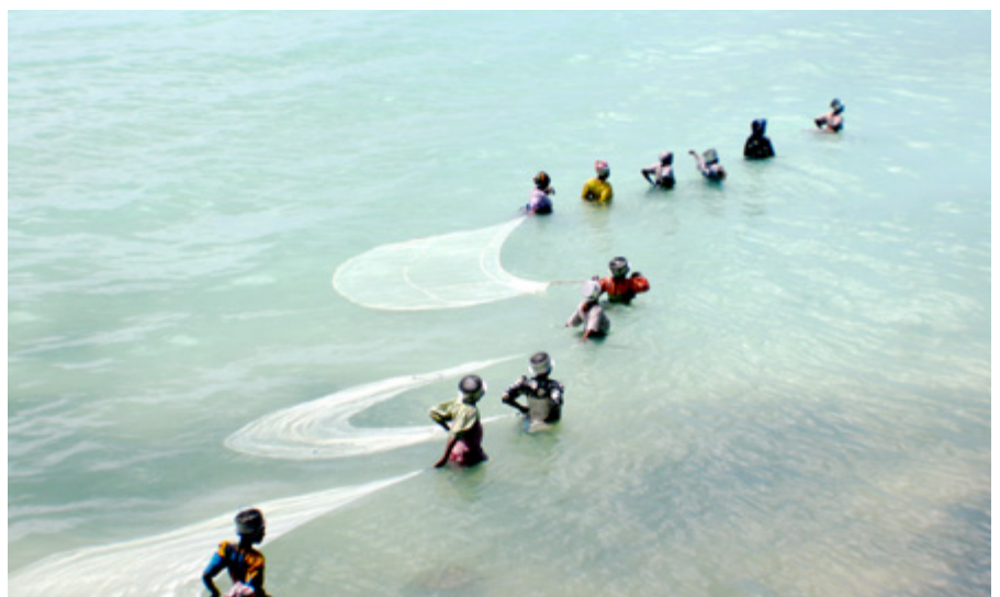
Photo: Matt Kieffer. Women fishing in the shallow water, Nungwi, Tanzania, 2008 < https://goo.gl/ajXnyX >.

“ Negative beliefs that women are inferior and less intelligent than men and that they are unfit to be leaders contribute to women’s under-representation in leadership positions in Tanzania.