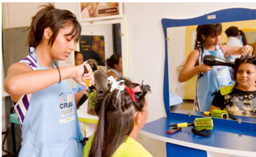
Hairdresser student, Formosa, Brazil, 2014 < https://goo.gl/e1b4gK >.

“ In many family arrangements, women do not participate in the decision-making process regarding the use of household resources and funds.