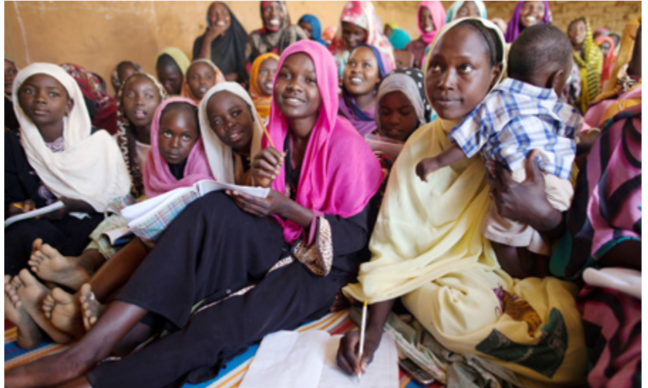
Women in English class, El Fasher, Sudan, 2014 < https://goo.gl/9L7BtY >.

“ Most CCTs were designed to alleviate poverty and did not have combating gender inequalities as a priority.