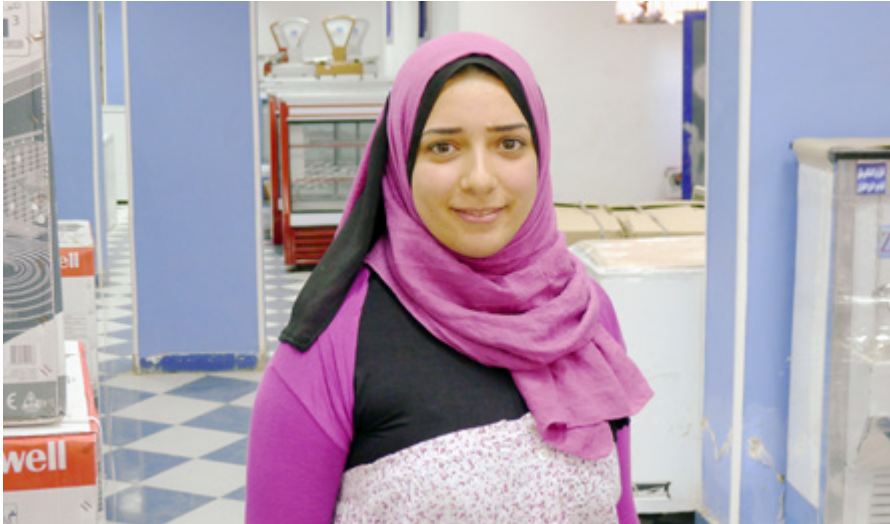
Photo: Dana Smillie/World Bank. Egyptian business woman who applied and got a loan which enabled her to start two businesses, Cairo, Egypt, 2011 < https://goo.gl/RbHSu7 >.

“Despite women’s varied economic activities, their welfare and protection from risk and deprivation are still perceived in Egypt as a function of families and not markets.”