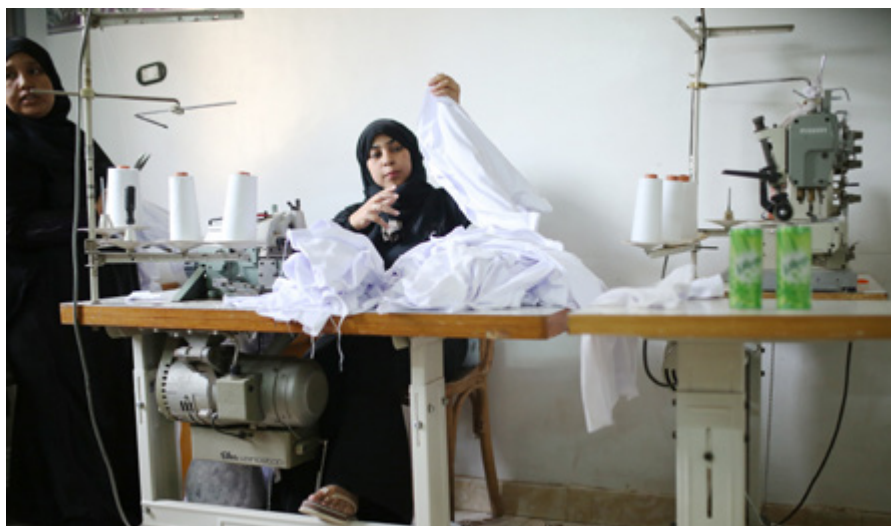
Employees work in a small business where the majority of the employees are young women from the neighborhood, Egypt, 2015 < https://goo.gl/Bn1Cqs >.

In a small pilot project whereby cash transfers were piloted in the urban low-income neighbourhood of Ain el Sira in Cairo, a clear association was found between the cash transfers and women's well-being. Interviews were conducted in April 2011 with 143 women who had received cash transfers over a two-year period. This was a turbulent time in Egypt