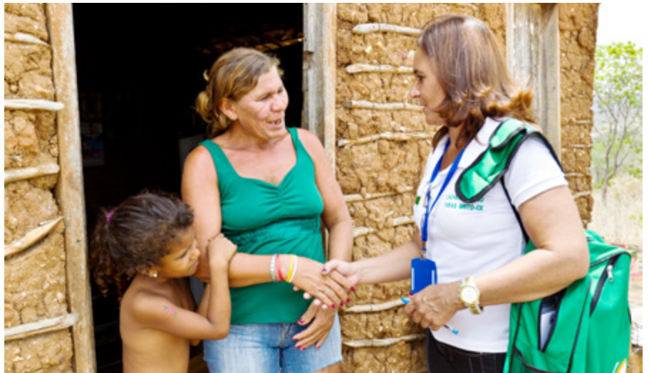
Social worker performs screening for the Single Registry of Beneficiaries, Brazil, 2013 < https://goo.gl/t6SZ6l >.

“ While the public debate echoed this paternalistic battle, the Programa Bolsa Família was being constructed with the participation of millions of women.