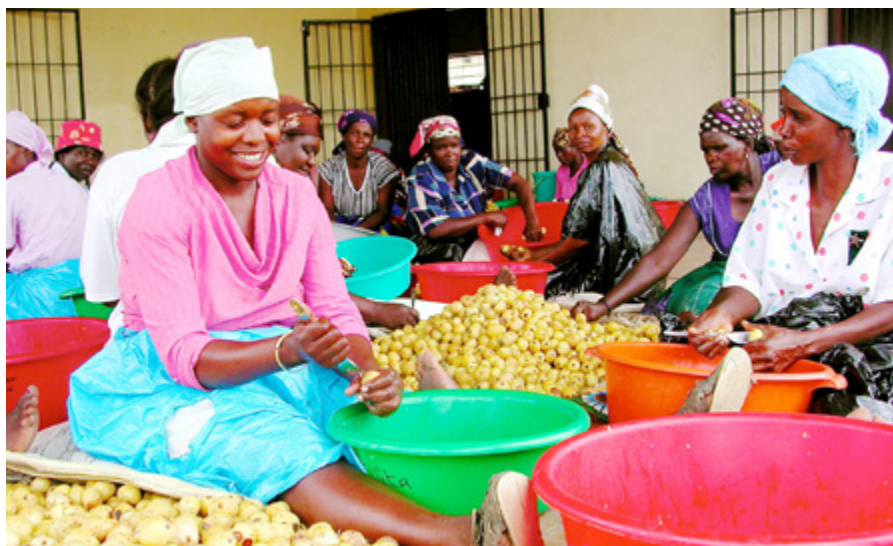
Women working at Amarula production, South Africa, 2006 < https://goo.gl/PS14al >.

“Brazil and many African countries have been consolidating their cooperation activities over the last decades, and the continuous, mutual interest in the area of social protection offers an important opportunity to address common challenges and interests in promoting gender equality.”