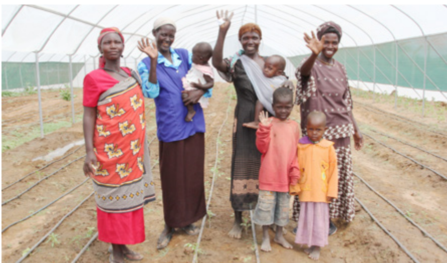
Photo: Marisol Grandon/DFID. Mothers support group with their budding tomato crop in Lodwar, Kenya, 2011 < https://goo.gl/TMRoHc >.

“Increasing women's resources or employment opportunities per se, if not accompanied by a collective engagement of their families and their communities, can undermine other fundamental capabilities, such as bodily well-being, security or social relations.