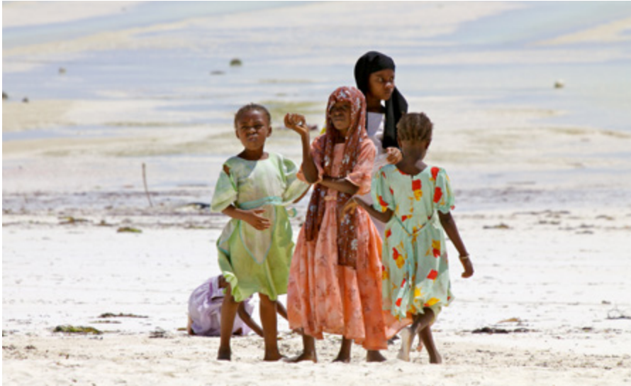
Photo: Konstantin Zamkov. Girls on the beach, Paje, Tanzania, 2008 < https://goo.gl/2weVwX >.

“ Women lack cultural capital in Tanzania, as they are largely affected by their gender roles.