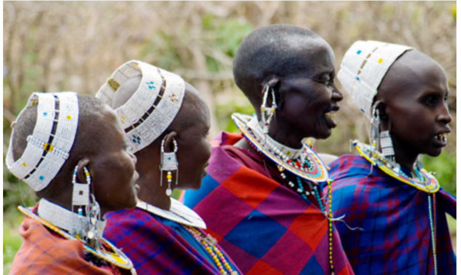
Photo: William Warby. Maasai villagers in the Serengeti National Park, Tanzania, 2008 < https://goo.gl/gcedFZ >.

“ Women’s struggle to achieve leadership roles in the community is by no means an easy task.