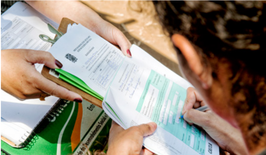
Woman fills out an application form for the Single Registry of Beneficiaries, São José dos Campos, Brazil, 2014 < https://goo.gl/FMVnj5 >.

“ This public policy has helped decrease infant mortality, supported the education of children and adolescents, and has empowered many women to expand their autonomy.