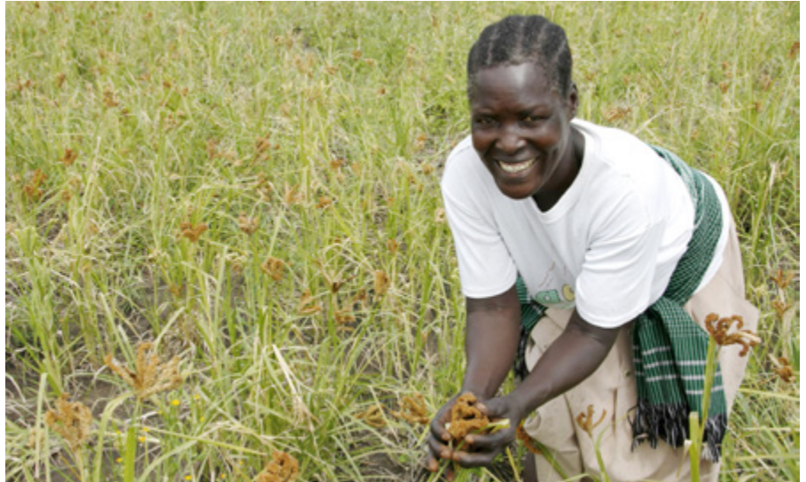
Woman in field, Uganda, 2011 < https://goo.gl/Ri5L9J >.

“ Addressing gendered vulnerability to poverty requires interventions that display gender-sensitive governance beyond the mere token inclusion of women on committees and in non-state actors.