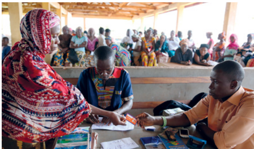
Woman receives cash transfer payment, Sierra Leone, 2015 < https://goo.gl/SjzXzq >.

In conclusion, social protection programmes can benefit greatly from the careful consideration and integration of the gender dimension, especially from an early design stage. They can be powerful tools for the achievement of gender equality and the empowerment of women, towards an overarching goal of inclusive development and the attainment of the sustainable development goals. ●