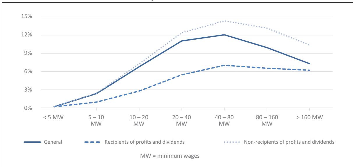
FIGURE 2 Effective IRPF rates for each income bracket, 2008

The importance of this analysis can be synthesised in the analysis of the effective rates applied to each income bracket. Regarding the breakdown of vertical equity, it is possible to observe that effective rates follow a parabola, from 0.20 per cent for the lowest income bracket to 12.05 per cent for the income bracket between 40 and 80 monthly minimum wages and 7.30 per cent for the upper income bracket. Horizontal equity is similarly violated, as for the same income brackets the effective rates applied to the groups who receive profits and dividends are systematically lower than those applied to those who do not. This is illustrated in Figure 2, which depicts the parabola comprising the effective rates applied to the three groups and shows how the curve of the effective rates applied to those who receive profits and dividends follows a path that is always below the group that does not receive this type of income.