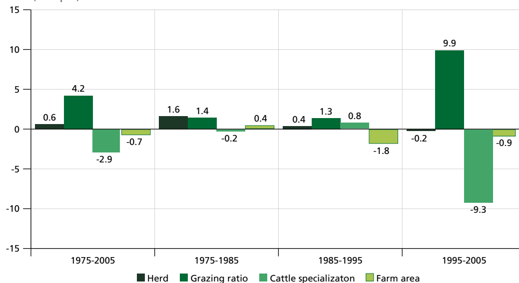
FIGURE 2 Average growth rates of municipal herd, grazing ratio, cattle specialization, and farm area for inter-census periods – Brazil (1975-2005) (In % p.a.)

Source: IBGE. Obs.: Geometric interpolations for the values of 2005.